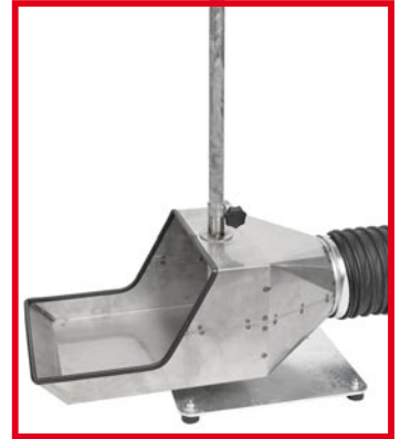
Bus & Coach Nozzle